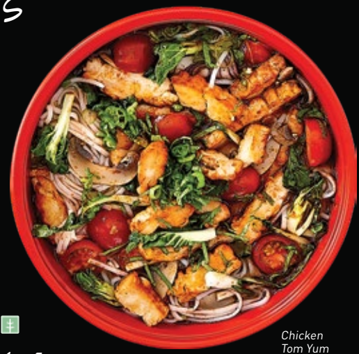
Chicken Tom Yum