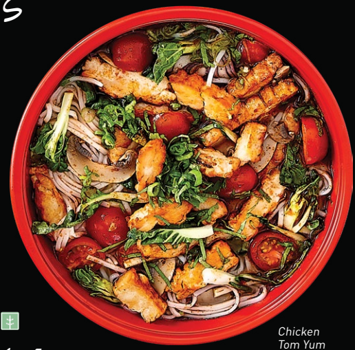
Chicken Tom Yum